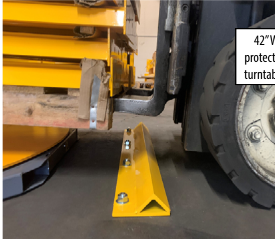
42" Wheel Stop shown protecting stretch wrapper turntable from forklift tires

This durable & long-lasting piece can save thousands of dollars when factoring in repairs to damaged machines and lost production with down time.