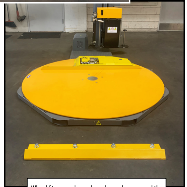
Wheel Stops can be anchored anywhere around the turntable to provide protection wherever it's needed