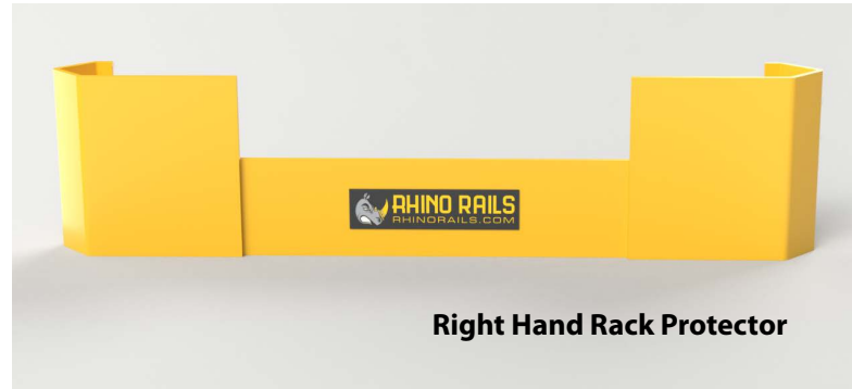
Right Hand Rack Protector