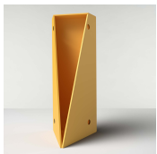
Outside Corner Adapter