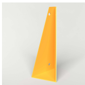
Inside Corner Adapter